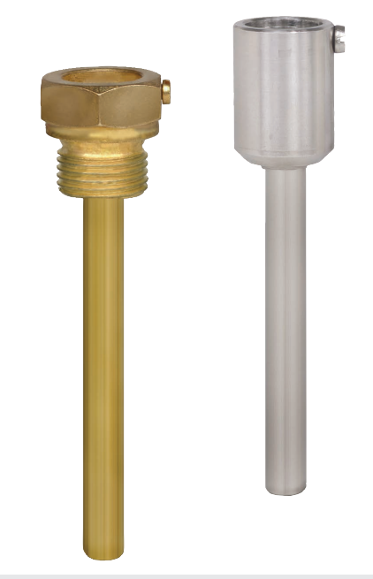
Fig. left: Thermowell with thread Fig. right: Thermowell with welding stud